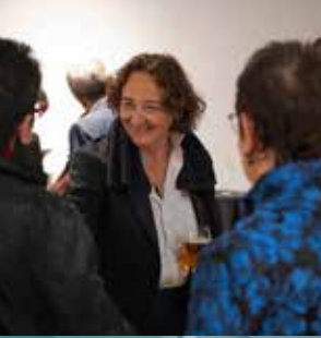
Nathalie Stutzmann Music Director