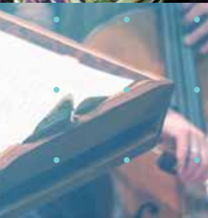
MARIA JOÃO PIRES