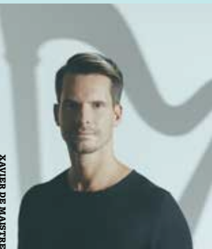
XAVIER DE MAISTRE